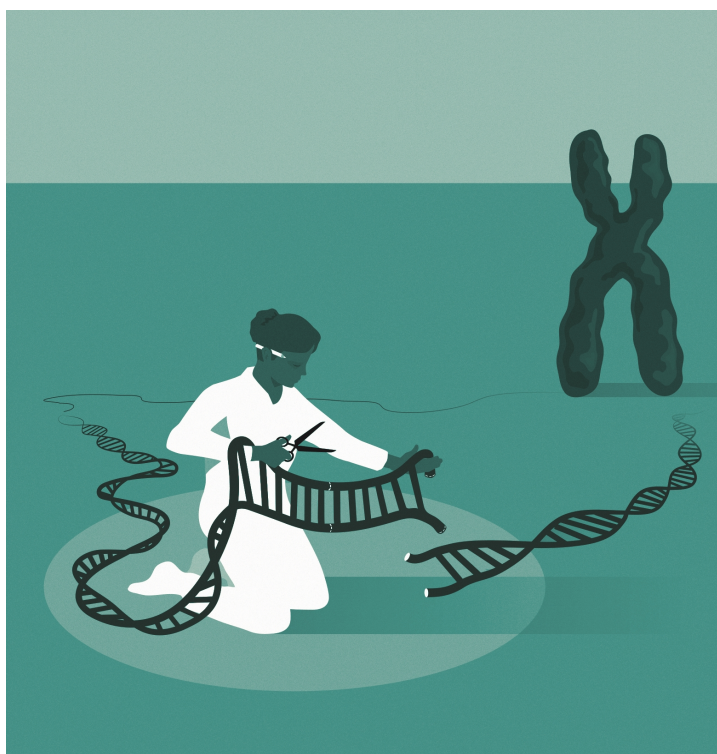
Figure 1. Using the genetic scissors, researchers can edit the genome of practically all living things.

The gene editor called CRISPR-Cas9 is one such unexpected discovery with breathtaking potential. When Emmanuelle Charpentier and Jennifer Doudna started investigating the immune system of a Streptococcus bacterium, one idea was that they could perhaps develop a new form of antibiotic. Instead, they discovered a molecular tool that can be used to make precise incisions in genetic material, making it possible to easily change the code of life.