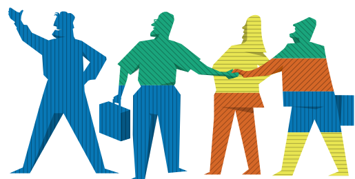
Participants in auctions of multiple interrelated objects – such as radio frequencies in different parts of the country – often want to bid on “packages” of objects. This complicates the auction’s design, especially if the seller wants to stop bidders from colluding to keep prices low.