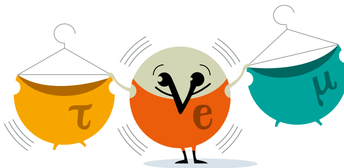
Torn between identities – tau-, electron- or muon-neutrino?

The hunt was on – deep inside the Earth in gigantic facilities where thousands of artificial eyes waited for the right moment to uncover the secrets of neutrinos. In 1998, Takaaki Kajita presented the discovery that neutrinos seem to undergo metamorphosis; they switch identities on their way to the Super-Kamiokande detector in Japan. The neutrinos captured there are created in reactions between cosmic rays and the Earth's atmosphere.