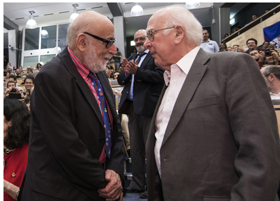
François Englert and Peter Higgs meet for the first time, at CERN when the discovery of a Higgs particle was announced to the world on 4 July 2012.

Both François Englert and Peter Higgs were young scientists when they, in 1964, independently of each other put forward a theory that rescued the Standard Model from collapse. Almost half a century later, on Wednesday 4 July 2012, they were both in the audience at the European Laboratory for Particle Physics, CERN, outside Geneva, when the discovery of a Higgs particle that finally confirmed the theory was announced to the world.