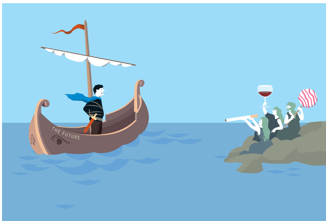
The myth of Odysseus and the Sirens is about the tension between the long-term, planning self and the short-term, pleasure-focused self.

Experiences that are close in time take up more of our awareness than those that are further off; a thousand krona next year is perceived as worth less than a thousand krona today, regardless of whether it is an income or an expense. In traditional economic theory this is described using discounting – the assumption is that both income and expenses reduce by a constant factor with every passing month or year. Using such an assumption, the ranking of two future alternatives will always remain the same.