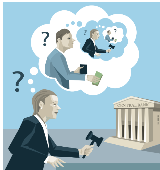
Central banks set the interest rate based on expectations about private sector developments.