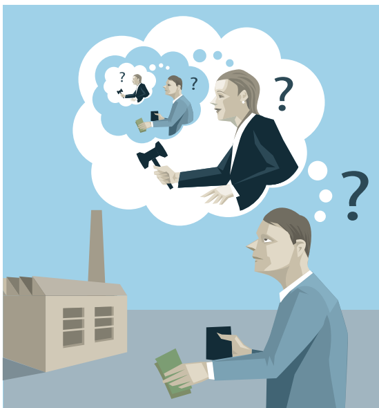
Investors base their decisions on expectations about future economic policy.

One difficulty in attempting to understand how the economy works is that the relationships are often reciprocal. Is it policy that influences economic development or is there a reverse causal relationship? One reason for this ambiguity is that both private and public agents actively look ahead. The expectations of the private sector regarding future policy affect today's decisions about wages, prices and investments, while economic-policy decisions are guided by expectations about developments in the private sector.