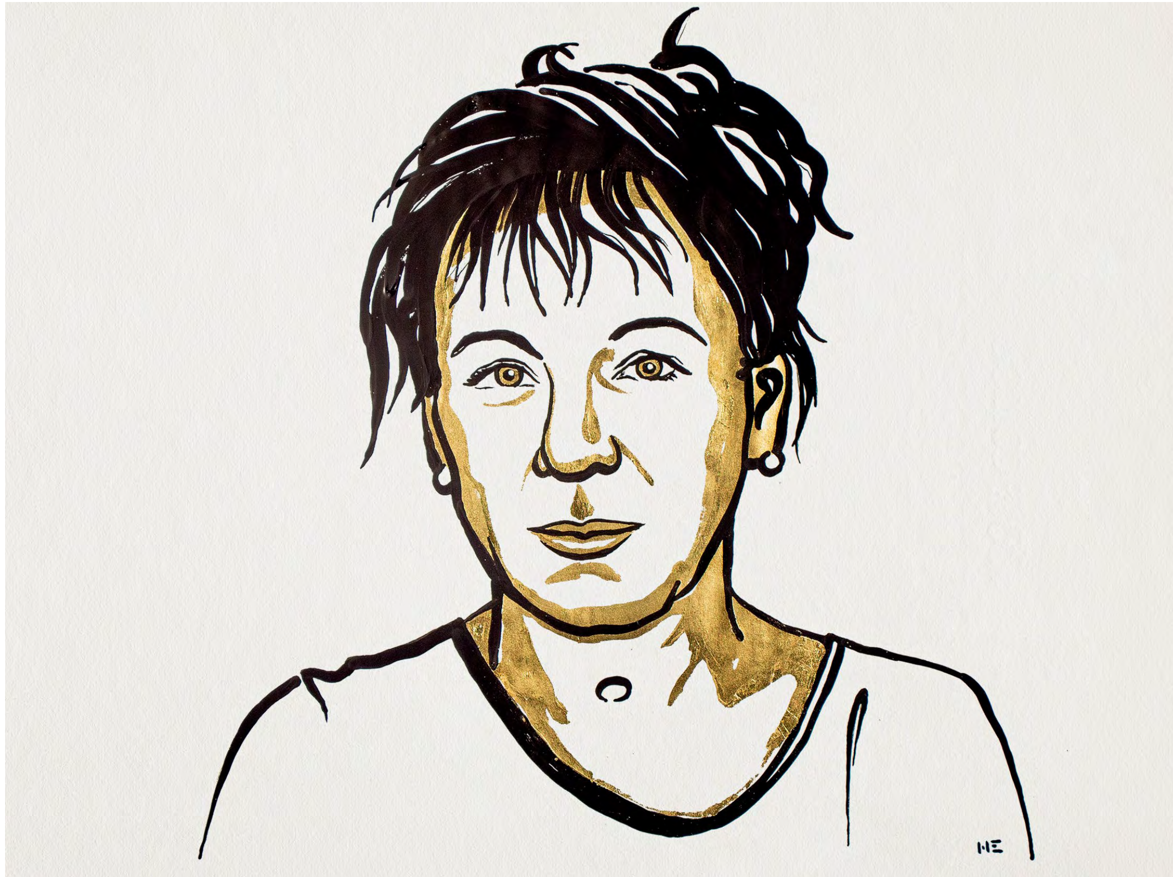
Olga Tokarczuk Born: 1962, Poland

"for a narrative imagination that with encyclopedic passion represents the crossing of boundaries as a form of life."